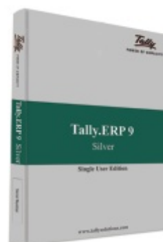
Tally.ERP 9 Silver (Single User)